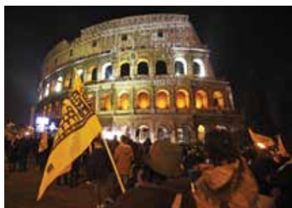
The Colosseum is illuminated with the 'Cities of Life' logo to support the campaign against the death penalty, in Rome, Italy, 30 November 2011.

Amnesty International and others helped us establish contacts with many panellists whose contributions are included in this book. The Governments of Chile, Italy and the Philippines co-organised events with us, and the Government of Italy contributed financially to the production of this publication.